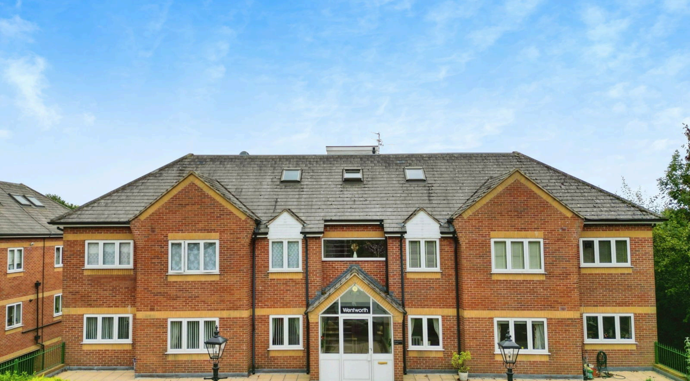
The Penthouse, Wentworth Court